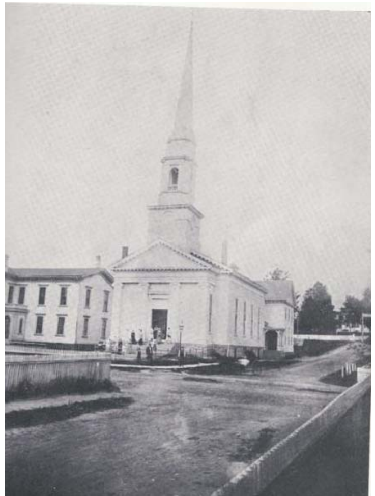
HCC with its original spire