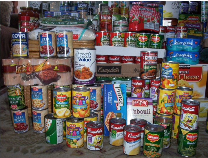
Only some of the 383 pounds of food collected!

We have enclosed a picture and hope that next year, all together, we could collect that amount ..... tenfold!