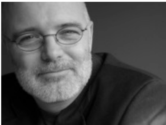
Keynote speaker Brian McLaren

Join with members of the Massachusetts, Connecticut, and Rhode Island UCC Conferences for this semi-annual time of worship, fellowship, education and inspiration! Workshops will be offered on a wide variety of topics like care and wellness, church vitality, faith formation, justice and witness, and leadership. Internationally renowned author and activist Brian McLaren will be the keynote speaker. For more information, visit www.macucc.org/ . Super Saturday will be held at Minnechaug Regional High School, 621 Main St., Wilbraham, MA.